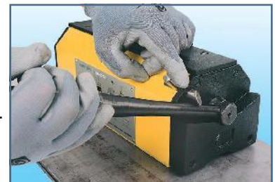
Use of the 2 hands necessary during deactivation

Neodyme-Iron-Boran magnets give concentrated and constant attraction Independent safety device prevents any accidental deactivation No weight bearing welds Load only held by the power of the permanent magnets with no electricity required Minimum maintenance required